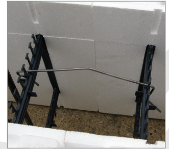
Horizontal Clips in Place

Note: You can skew the HV Clip a notch or two for an even tighter fit, if needed.