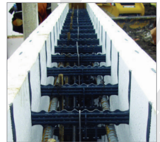
Showing HV Clips holding down a top row that has been cut down to +/- 8" in height

Using the Fox Block HV clip eliminates the need for truss wire completely on your jobs. The result is that for about 1/2 the cost of the truss wire you will get a stronger and straighter job.