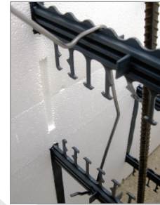
Vertical Clips in Place